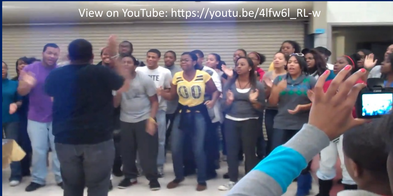
Cleveland Heights HS Student-Directed Gospel Choir