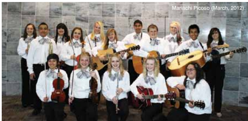
Mariachi Picoso (March, 2012).

and it was well received by the community.